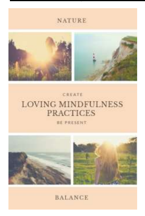
Step 3- Loving Mindfulness Practices

Imagine being able to experience complete physical, emotional and spiritual wellness and peace whilst going through your loss recovery process. This is possible with loving mindfulness practices. These practices can support you to calm your mind, body and spirit in times of grief and stress. You can develop the ability to ground yourself in the present moment, allowing yourself to feel your body and your surroundings by engaging all your senses in the now. Practicing mindfulness calms your nervous system and helps you feel safe. It takes you out of the angst, sadness and pain and brings you fully into the present. There are various types of loving mindfulness practices for you to explore and experience. Take some time to discover the ones that most resonate with you. These practices will help to support you through your grief and towards recovery from your loss. They can be used daily whenever you feel overwhelmed to bring you back to this present moment, where you are safe and well and loved. I have listed some loving mindfulness practices for you to discover and try for yourself. You may find out that sometimes it is the simplest of things that can help us find that relief and support to recover from the pain of loss. Ask yourself: "What can I give myself today that will help me feel more at peace and in this moment?"